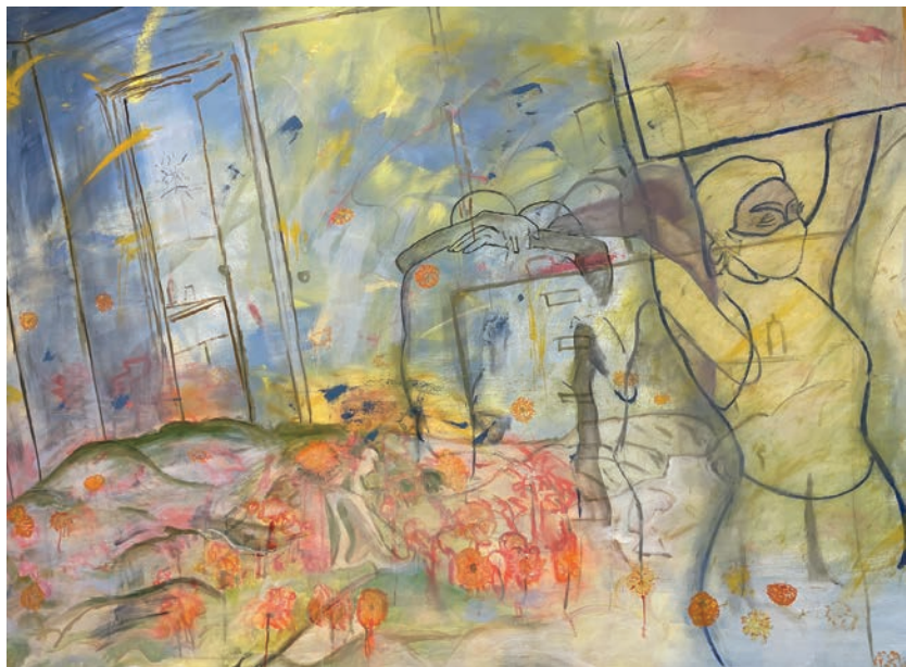
Fred Marque DeWitt: The Bedroom , 2020; oil on canvas; 72 × 96 in.; courtesy of the artist.