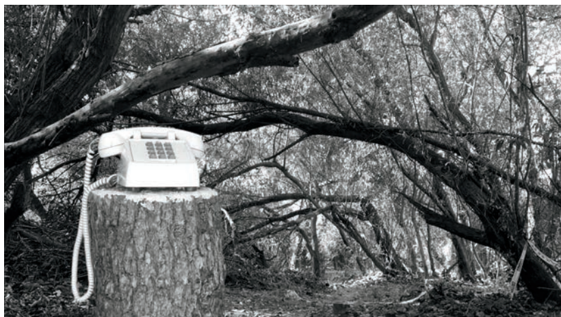
champoy: still from Ancestors Calling Collect , 2021; digital video (shot on 16mm and digital); 52 min.; courtesy of the artist.