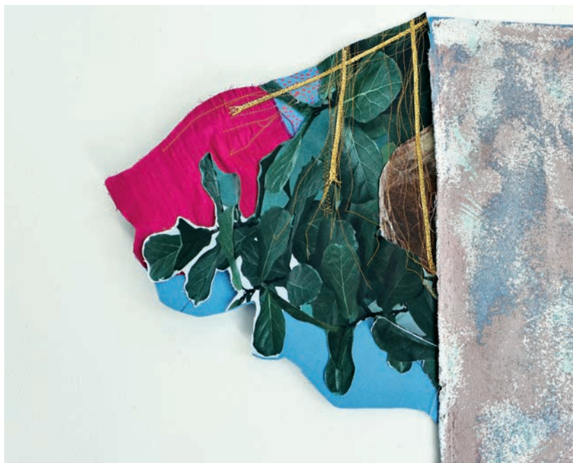
Nadia Shihab: Rough Cut , 2020 (detail); inkjet print on cotton, embroidery, and acrylic paint; dimensions variable; courtesy of the artist.