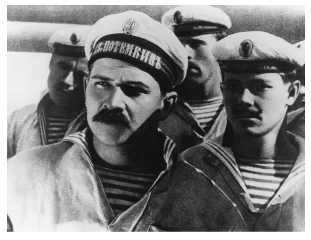
Agnès Varda, Le bonheur , 1965 Sergei Eisenstein, Battleship Potemkin , 1925