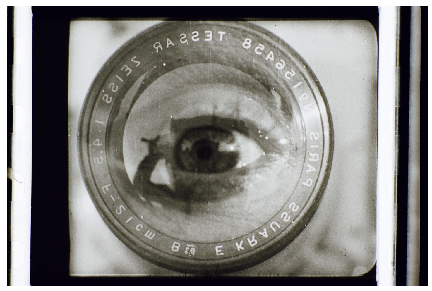
Dziga Vertov, Man with a Movie Camera, 1929.